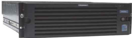
VTS OmniFlex Series